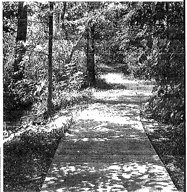
Places for reflection

Registration 6pm Friday (First Conference @ 8pm)