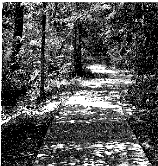
Places for reflection

Registration 6pm Friday (First Conference @ 8pm)