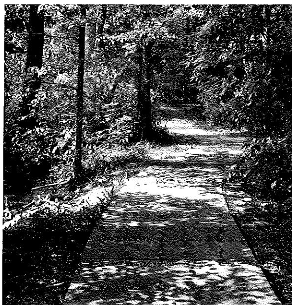
Places for reflection

Registration 6pm Friday (First Conference @ 8pm)